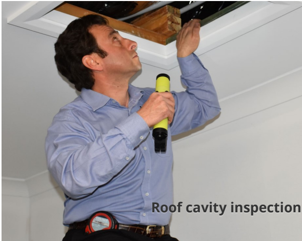
Roof cavity inspection

An Independent Property Inspection is a meticulous systemized inspection of more than 350 items throughout the whole property. Within 24 hours, a comprehensive written report will give you complete understanding of the condition of the property.